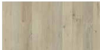
Balboa Oak AV75OBAL