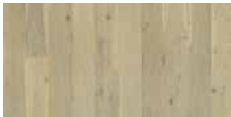
Huntington Oak AV75OHUN