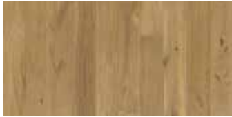
Malibu Oak AV75OMAL