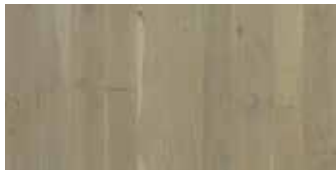
Santa Monica Oak AV75OSAN