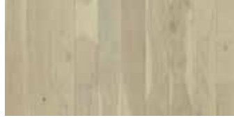
Venice Oak AV75OVEN