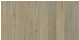
Doheny Oak AV75ODOH