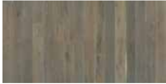
Big Sur Oak AV750Big