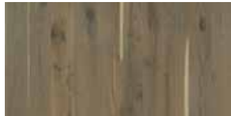
Pismo Oak AV75OPIS