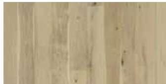
Cardiff Oak AV75OCD