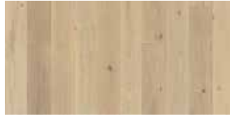
Laguna Oak AV75OLAG