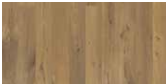
Del Mar Oak AV75ODEL